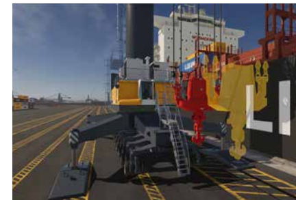
Luffing gear training