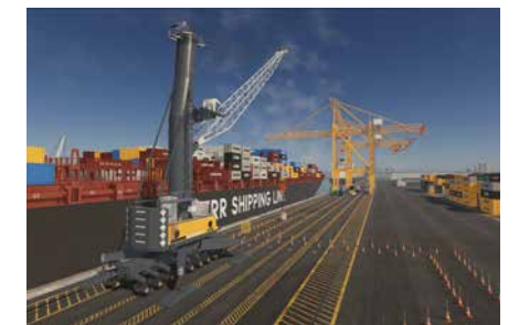
Lifting loads through narrow passages