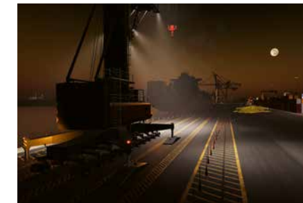
Different weather and lighting conditions