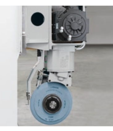
The internal grinding head can easily be put on and has the same advantages as the LFG-grinding head: NC-coolant nozzle and automatic measuring unit.