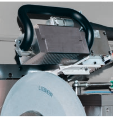
The optimum coolant feed is distinguished by an automatic nozzle tracking and variable jet stream contour.