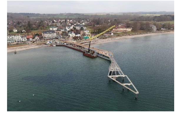
liebherr-ltm-1300-6-2-jordt-3.jpg The LTM 1300-6.2 is equipped with a 70-metre-long luffing jib.