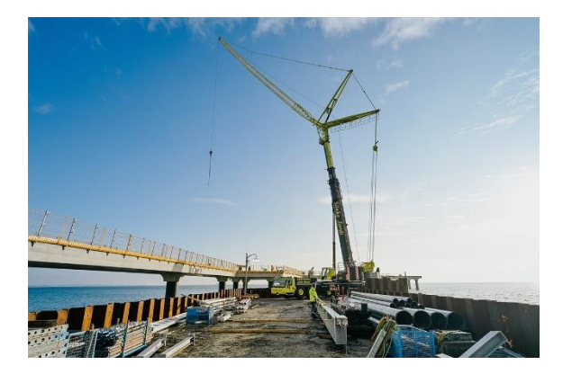
liebherr-ltm-1300-6-2-jordt-1.jpg The LTM 1300-6.2 stands on a nine-metre-wide cofferdam and does its job.