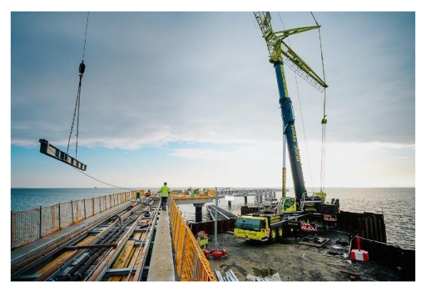
liebherr-ltm-1300-6-2-jordt-4.jpg The LTM 1300-6.2 lifts a steel construction element on the nine-metre-wide cofferdam.