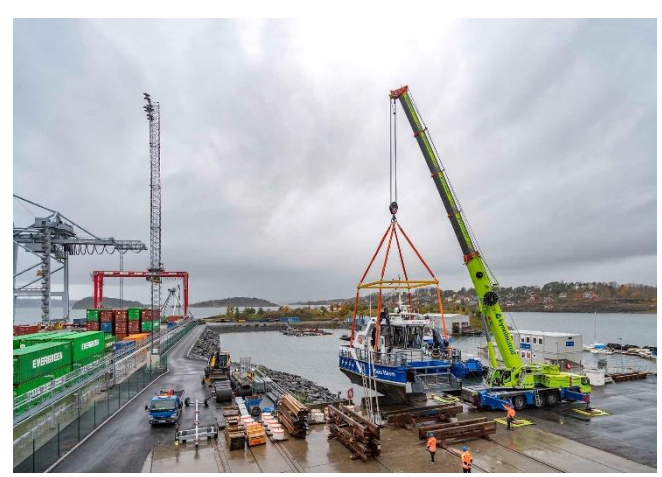
liebherr-ltm1230-5-1-nordic-cranes-2.jpg Every year, the "Pelikan II" is lifted out of the water for inspection.

liebherr-ltm1230-5-1-nordic-cranes-1.jpg The electric ship moves to the edge of the harbour basin. In the background, the mobile crane is being prepared to lift the boat.