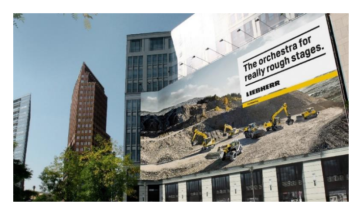
liebherr-brand-design-billboard.jpg Liebherr's brand design was awarded the iF Design Award 2023. It already received the Red Dot Design Award last year.