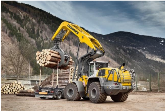
liebherr-l580-loghandler-xpower-new-version-2023-3.jpg The Liebherr L 580 LogHandler XPower® loads a lorry with logs.