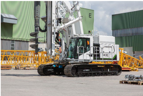
liebherr-lb30unplugged.jpg Liebherr once again electrifies the drilling rig series with the LB 30 unplugged.