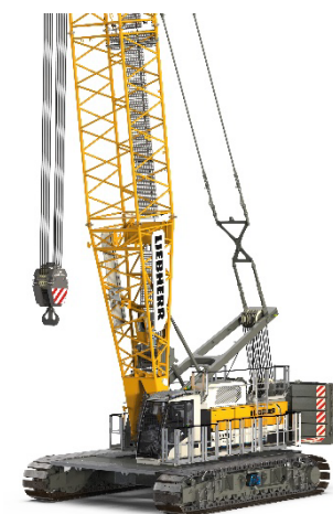
liebherr-lr1130unplugged.jpg The new Liebherr crawler crane type LR 1130.1 is available as electro-hydraulic and conventional version.