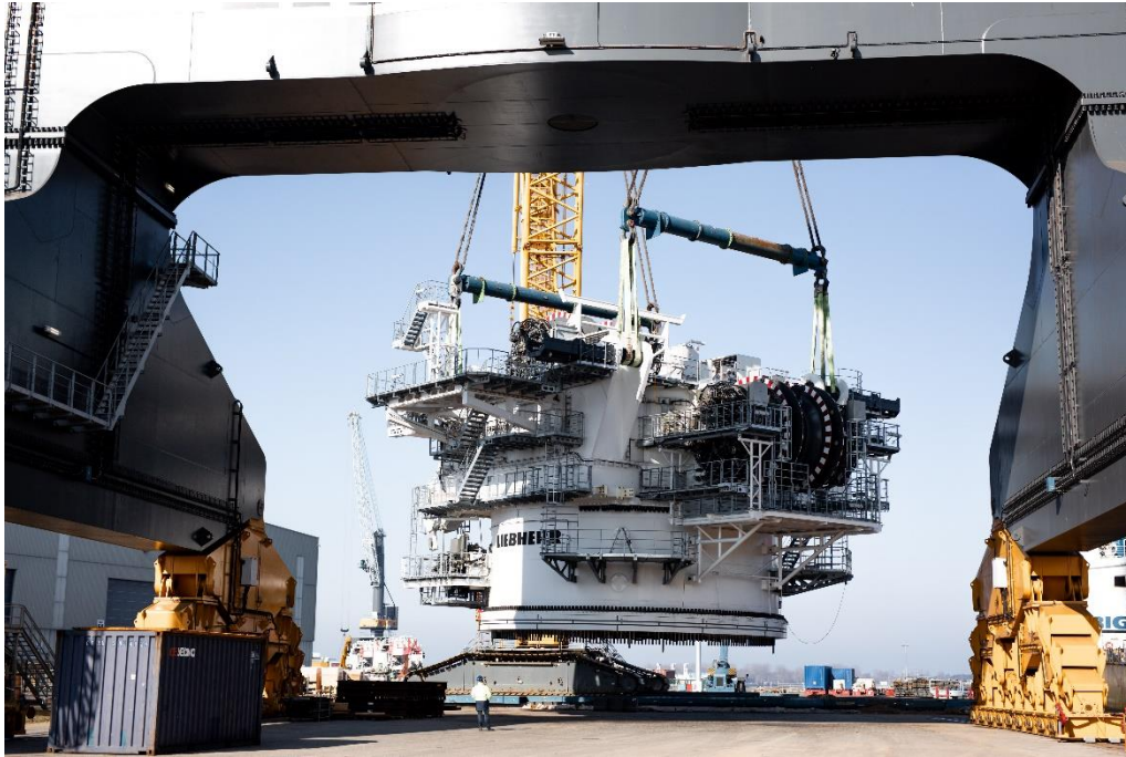
The slewing platform and the A-frame of the HLC 150000 have been lifted onto the BigLift Barentsz.