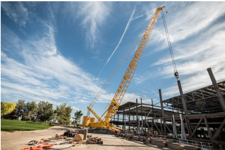
A Dielco Liebherr LR1500 crawler crane at work