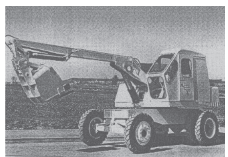
Liebherr hydraulic excavator A 300 from 1957