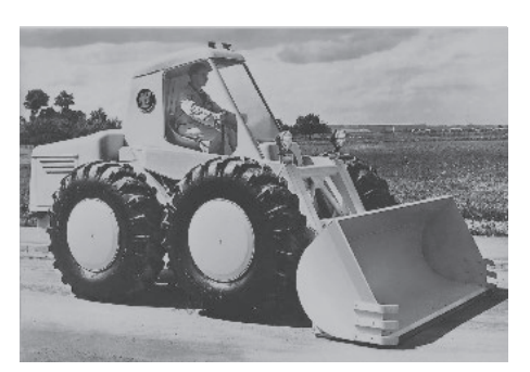
The Elephant Type 90 was produced as prototype in 1954