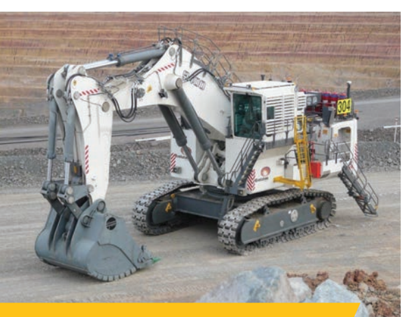
» Evolution's newest R 9400 at Lake Cowal mine

The new R 9400 joins two other Liebherr R 994 B excavators on site, one of which was commissioned in December 2005 with a current SMU of 75,000. It holds the record for the highest SMU in this class in the southern hemisphere; not far behind the world record holder of a Liebherr R 9350 in Russia with 76,000 SMU.