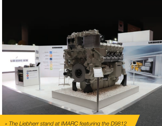
» The Liebherr stand at IMARC featuring the D9812 Diesel Engine.

The Liebherr stand and D9812 engine stood proudly in the exhibition hall and visitors were very interested in the 9 tonne diesel engine, other technologies, and the scale mining models that were on display. Congratulations to the three lucky draw winners who won R 9800, T 264 and PR 776 scale models.