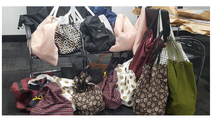
22 bags ready to be donated to Share the Dignity.

This year, over 138,000 bags were collected Australia-wide.