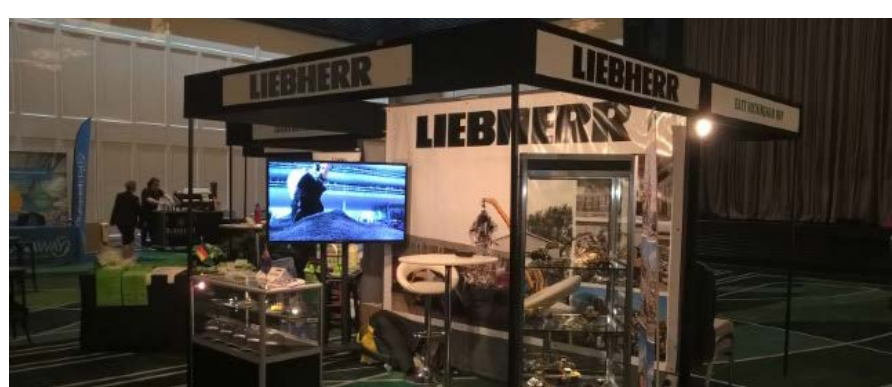
The Liebherr stand at Waste and Recycle Conference in WA.

Liebherr Earthmoving division recently participated in the Waste and Recycle Conference in Perth in September 2018. With over 400 attendees over the two dates, this event is the industry's premier gathering in Western Australia.