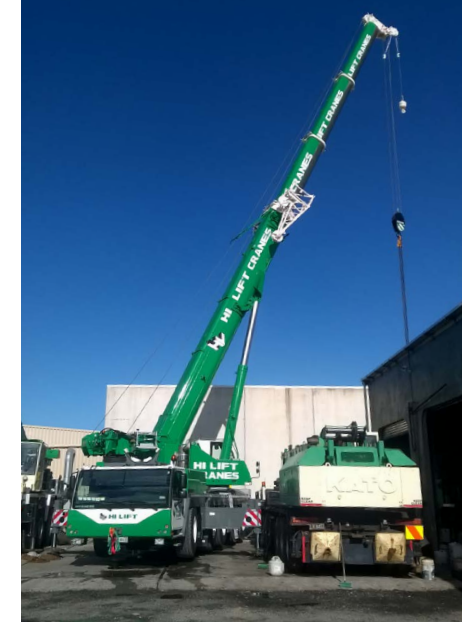
Hi Lift Cranes' LTM 1160-5.2.