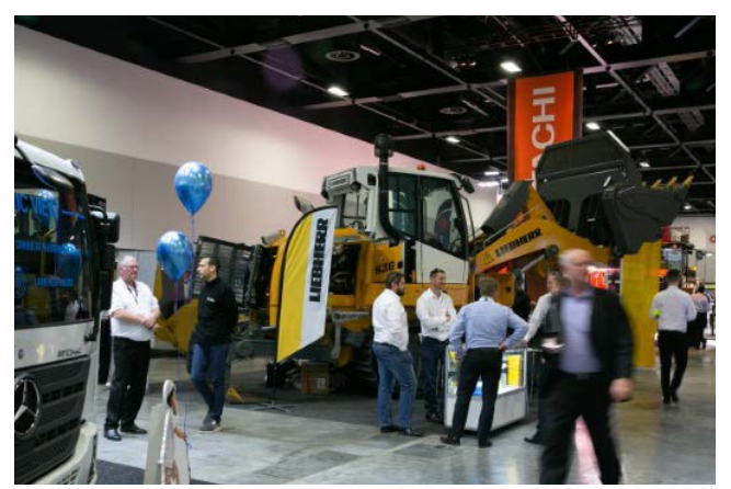
The LR 636 at AWRE in Sydney.

Liebherr exhibited an LR 636 Crawler Loader at the Australasian Waste & Recycling Expo (AWRE) at Sydney's International Convention Centre in August last year. The event received record attendance in 2018 with over 2,000 visitors and Liebherr was well received among those who attended.