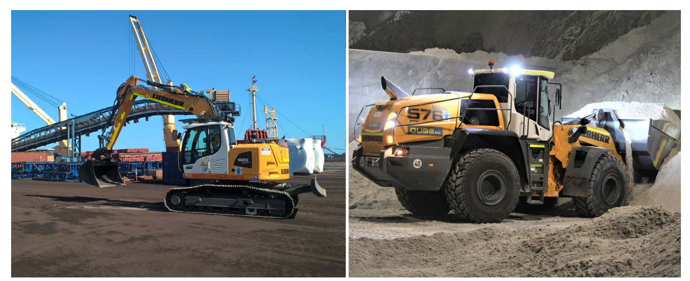
Qube Bulk's R 920 Crawler Excavator on site.

Qube Bulk has been pleased with the performance of their fleet, with Qube Bulk Director Todd Emmert stating, "The purchase decision was based on a desire to seek significant fuel burn savings and to drive improved productivity. We are over the moon with the initial trials."