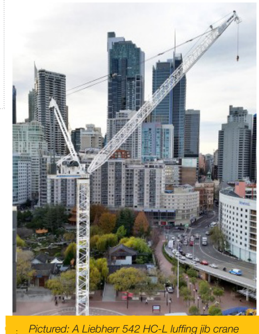
in Darling Harbour.