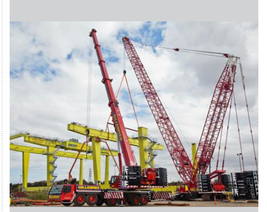
Pictured Below: LTM 1200-5.1 Mobile Crane sold to McMahon Services from Dry Creek, SA.

Pictured Below: LTM1350-6.1 and LR 1350/1 Mobile Cranes delivered to Gillespies Crane Services from Rozelle, NSW. Dual lift using the new LTM 1350-6.1 and LR 1350/1 Mobile Cranes.