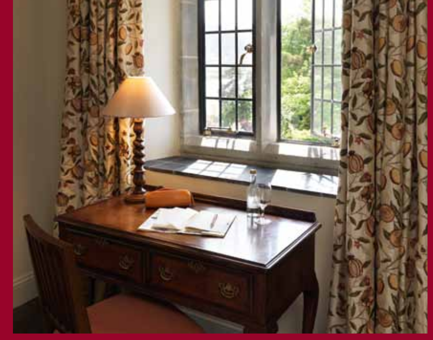
Crisp Irish linen, freshly cut flowers from the gardens, picture postcard views