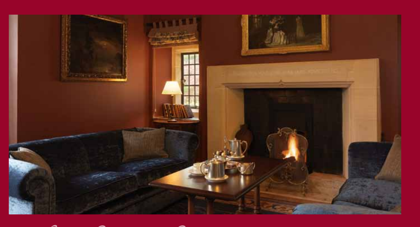
for others it's the inspiration to write one