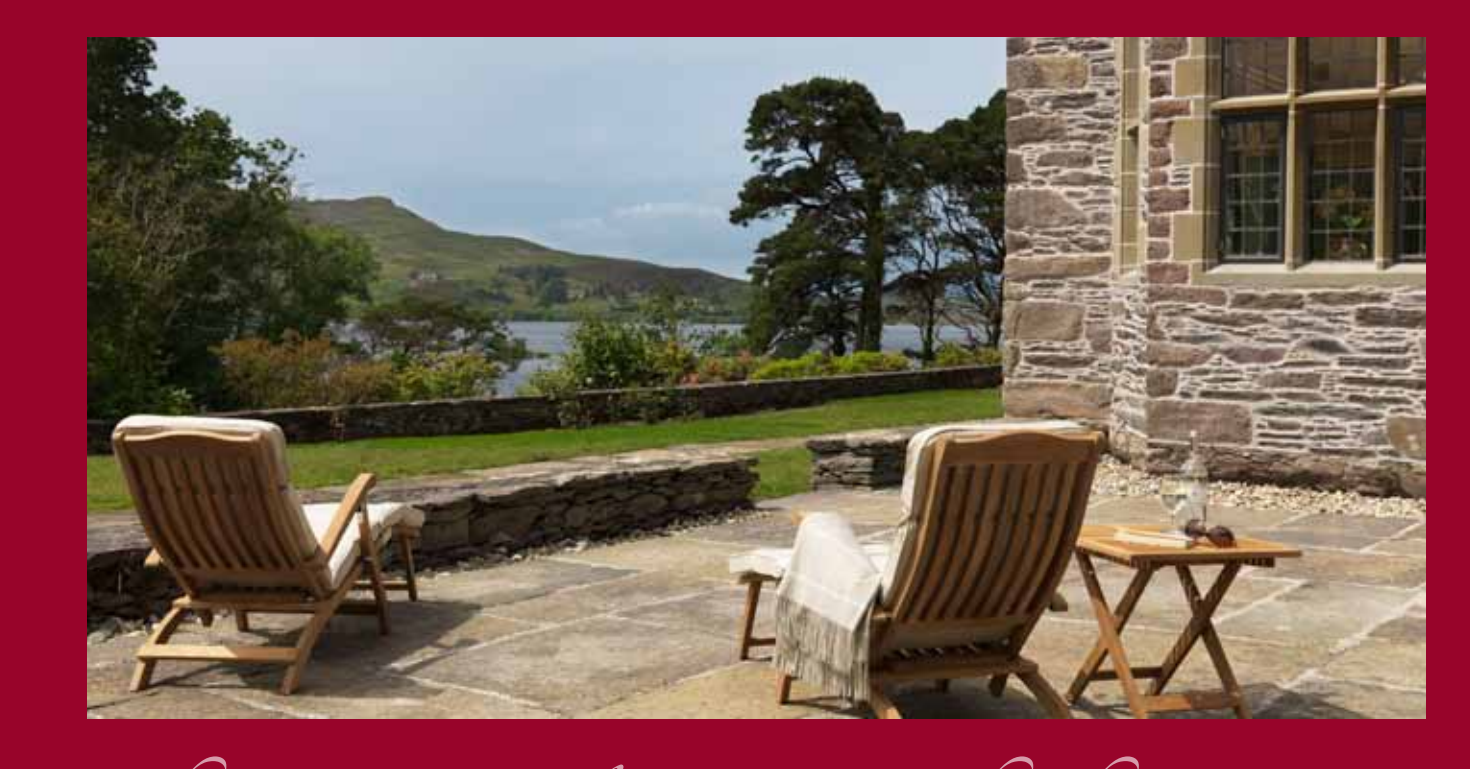
The water as it laps against the shore A chance to simply catch your breath