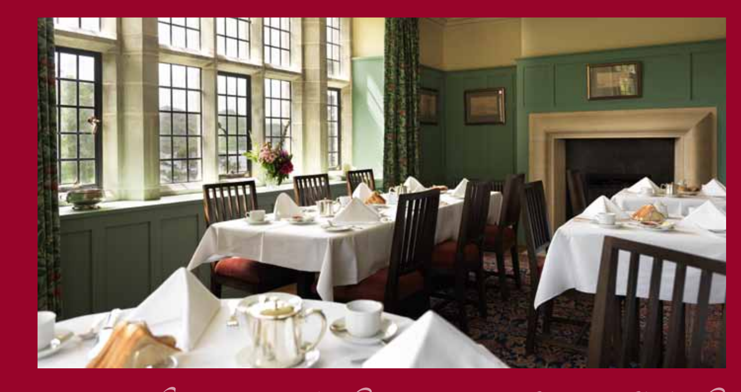
Breakfast in sunlight, Dinner by candlelight, Friendship by firelight