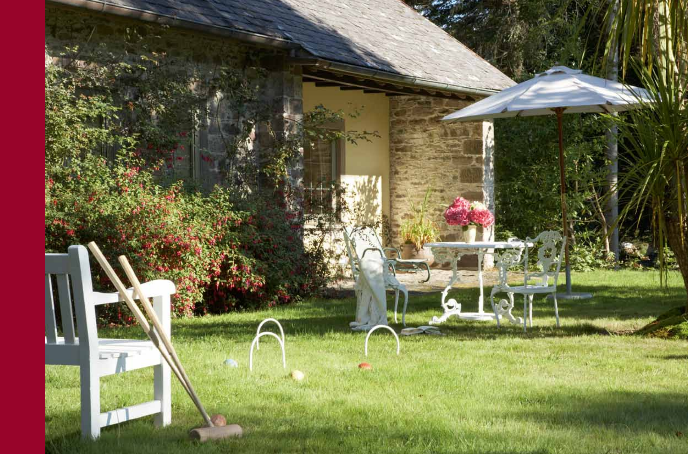
The Garden House at Ard na Sidhe