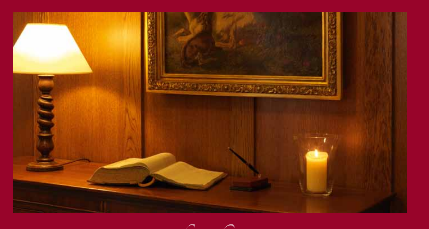
Some quests arrive for the first time For others it is like returning home