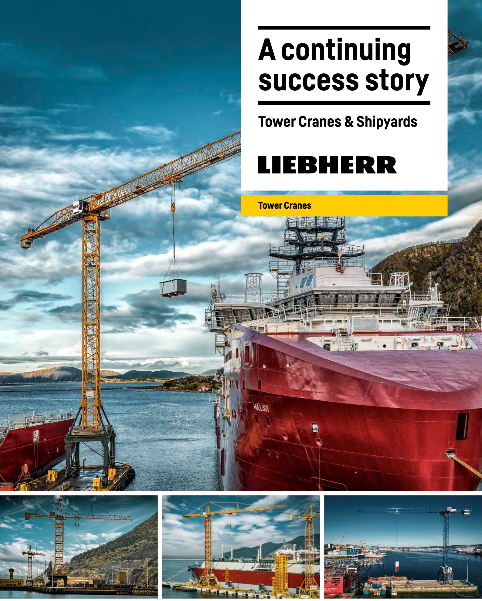
Economical - Efficient - Sustainable - Reliable - Safe