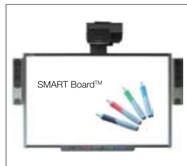
SMART Board™ Interactive Whiteboard

At this point we would like to point out that generally only theoretical customer training courses are performed at the Training Centre LWN. Practical training courses cannot be performed for safety and organisational reasons. For practical training courses, we recommend training on-site directly with your machines. The training content for on-site training courses is specially adapted to the respective device and the requirements of the participants.