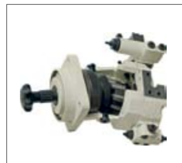
Sectional model of a hydraulic engine