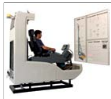
Simulator for Liebherr rammers and drilling rigs