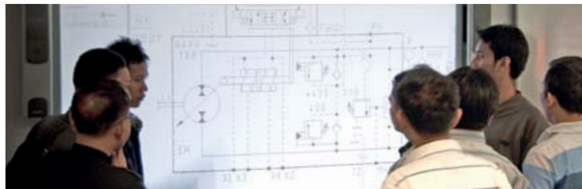
Explanation of a hydraulic system using a SMART Board™

Extensive teaching and learning media make knowledge accessible and are perfectly optimised for the respective training courses. Simulators for all types of control systems allow risk-free operation, error simulation and subsequent troubleshooting by participants. Through visualisation on the interactive SMART Board™, several participants can easily perform these tasks at the same time. Original sectional models of important components, as well as animations, are indispensable in explaining many procedures.