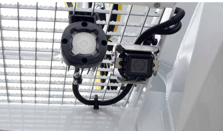
Working lights on the left and reversing camera on the right

Retrofit set including cable set suitable for all generations