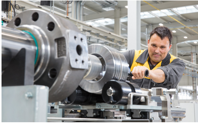
Piston rod assembly line Assembly of piston to rod with automized process inclusive torque controll

Every single cylinder leaving Liebherr's factory is tested with more than 30% overpressure on test benches specifically developed for mining purposes.