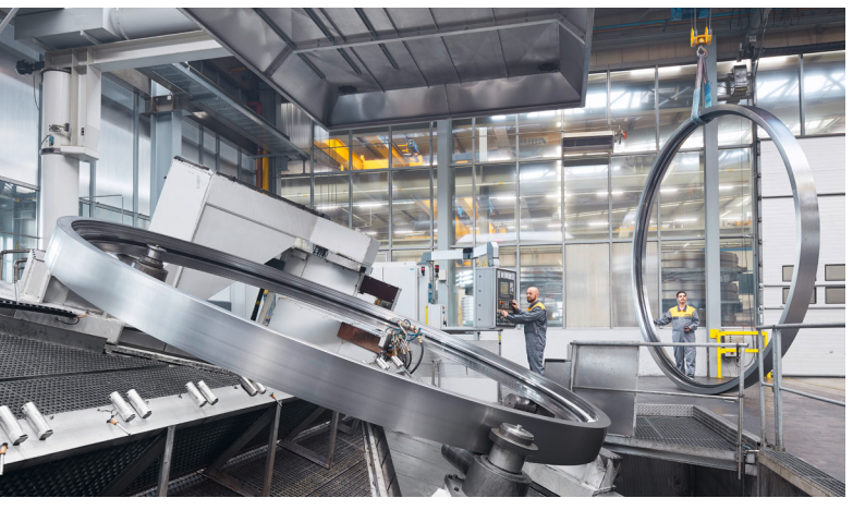
Induction hardening process

Every part of the slewing bearing is checked for its geometry, surface, cracks and hardness for zero failures.