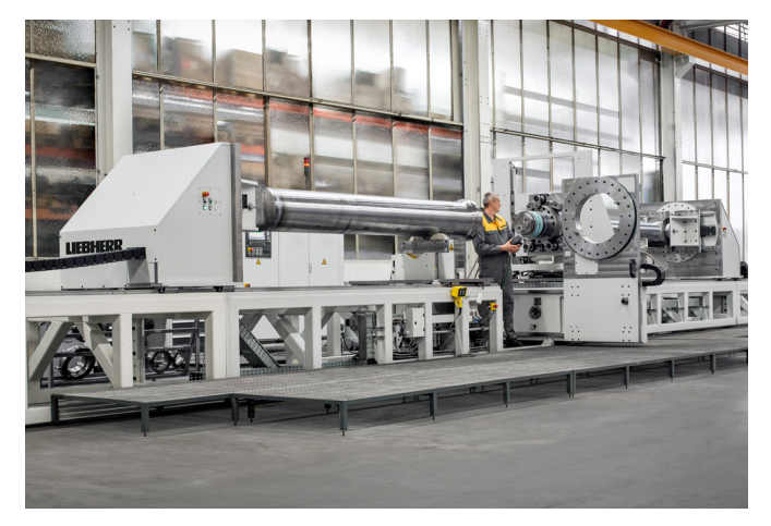
Mining cylinder assembly line Designed by Liebherr to assemble heavy duty cylinders in highest precision

Cylinder parts such as barrels and piston rods are all manufactured in-house. Functional surfaces are treated with latest honing processes to reduce wear. Piston rods are forged to be even stronger than welded. Chrome surfaces are applied in a special multy-layer coating to avoid any corrosion. Extensive quality management and highest standard in cleanliness ensure a perfectly working cylinder.