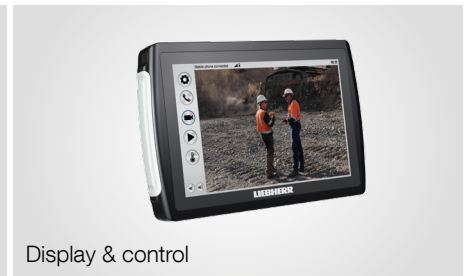
Display & control