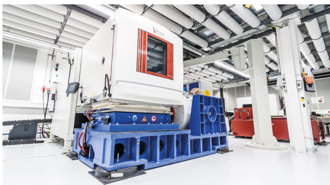
Qualification, analysis, verification – from one source