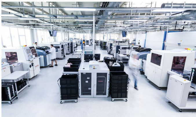
Modern equipment ensures optimized manufacturing costs