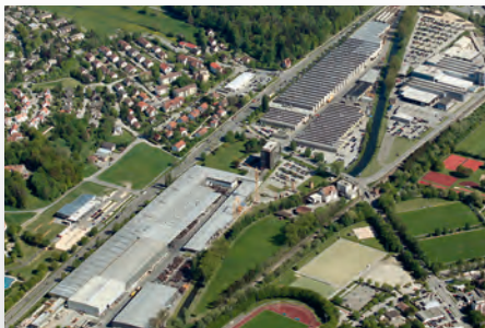
Biberach/Riss (Germany): large diameter bearings, gearboxes, rope winches, switchgear, electronics, electrical machines