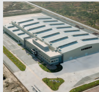
Monterrey (Mexico): large diameter bearings