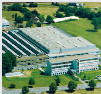
Ettlingen (Germany): remanufactured components