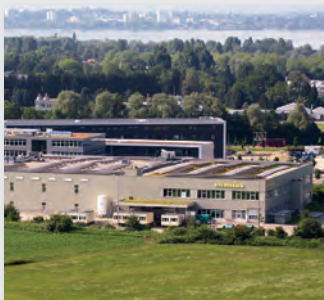
Lindau (Germany): electronics, power electronics