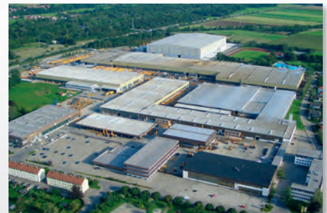
Kirchdorf (Germany): hydraulic cylinders