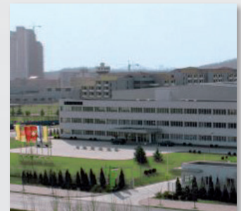
Dalian (China): gearboxes