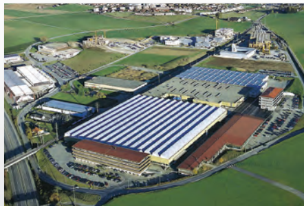
Bulle (Switzerland): diesel engines, gas engines, splitter boxes, axial piston units, injection systems