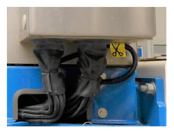
- Pull the Service Disconnect.