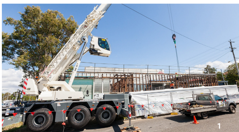
The machine only took a week to build.