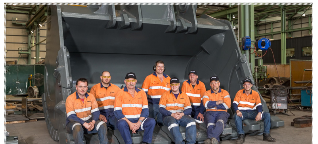
Pictured: Liebherr-Australia staff members sitting in one of Liebherr's buckets at the Bucket Manufacturing Centre in Adelaide.