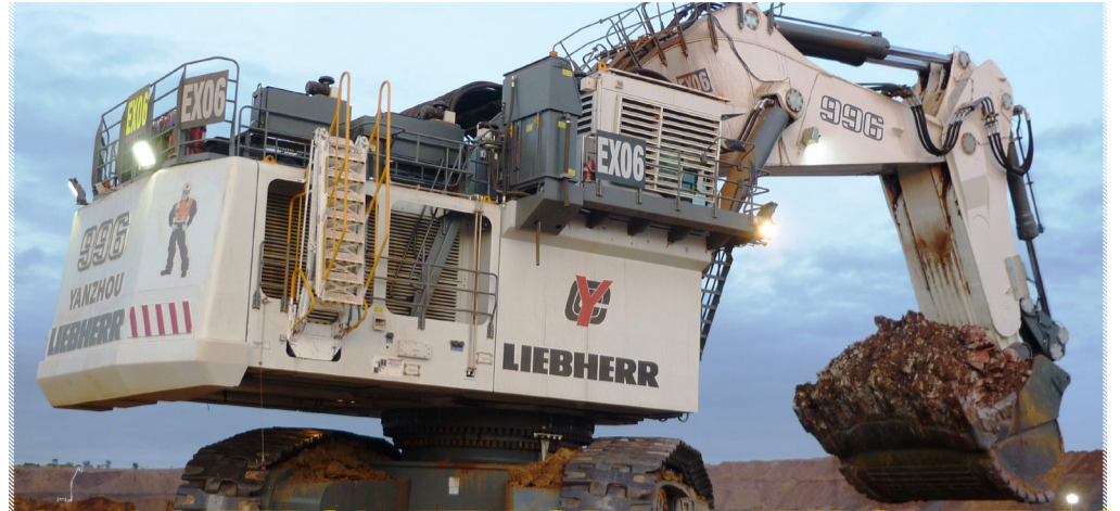
Pictured: Liebherr R 996 B at work at Yancoal's Yarrabee mine.