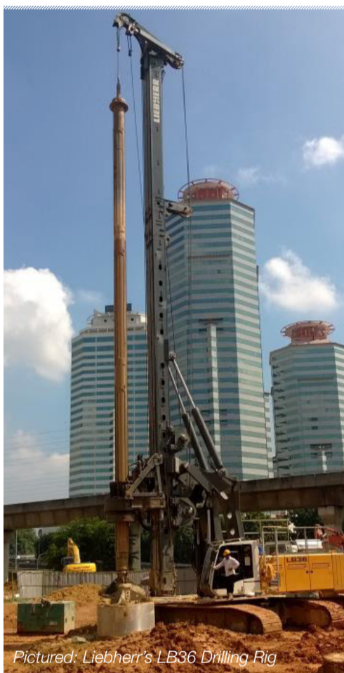
Pictured: Liebherr's LB36 Drilling Rig