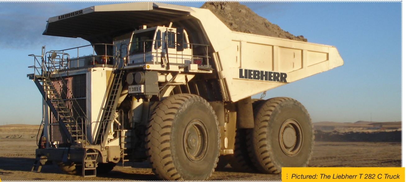
Pictured: The Liebherr T 282 C Truck

Liebherr is proud to announce the launch of the T 282 C Extended Life Profile back in May that highlights the evolution of the T 282 Series Haul Truck.