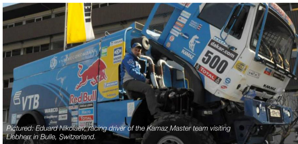
Pictured: Eduard Nikolaev, racing driver of the Kamaz Master team visiting Liebherr in Bulle, Switzerland.