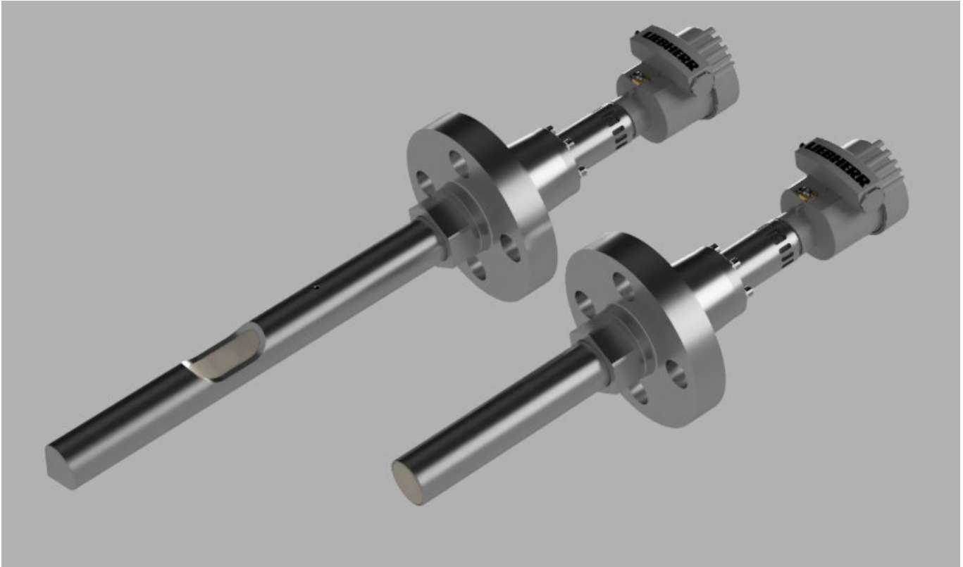
Rod sensor P45-GD