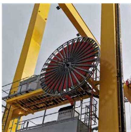
Cable reeling drum