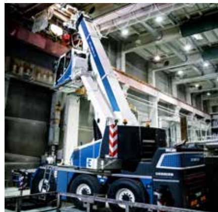
Typical areas of application for the Liduro Power Port: Construction sites with limited or no mains connection