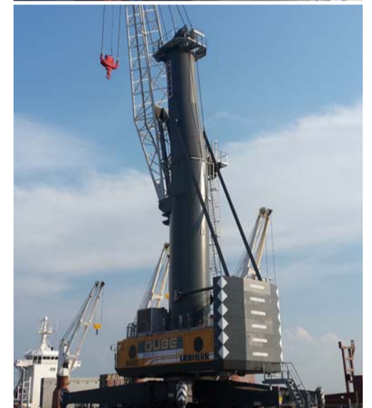
Pictured: Port of Tauranga LHM 550 and Qube Ports LHM 550