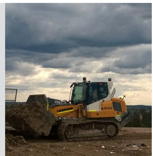
Pictured: The Liebherr LR 634 hard at work

the best possible outcome. Given the high compaction rates with low running costs and versatility, the LR 634 Crawler Loader became Council's desired choice for the landfill and future-proofing the purchase going into the new transfer station; Council has provided feedback stating superior quality of the Liebherr machine, and the excellent service by Liebherr-Australia.