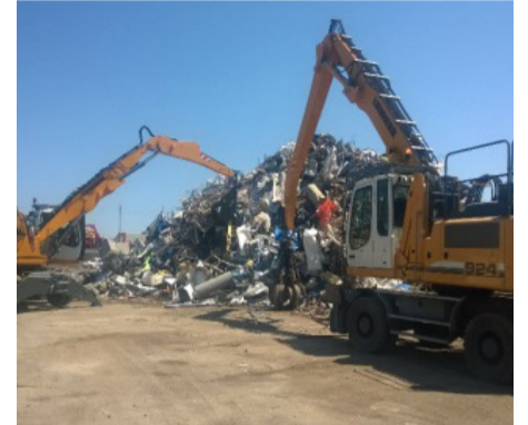
Pictured: Liebherr material handlers at work at the Wacol site.