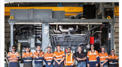
Pictured: the Liebherr-Perth team with the module they worked on.