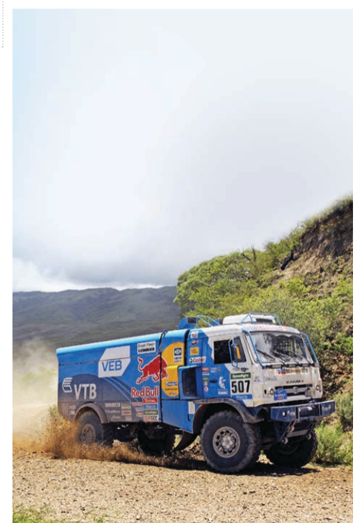
Pictured: one of the Kamaz team's entries for 2015 Dakar Rally, powered by Liebherr.