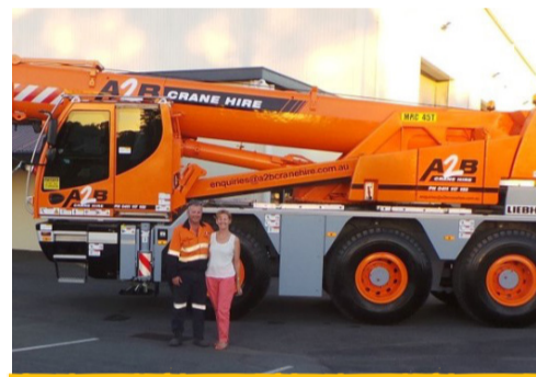
Pictured Above: The 45 tonne Liebherr crane purchased by A2B Hire.

maximum eye level of 7.8 m, enhancing visibility on site.