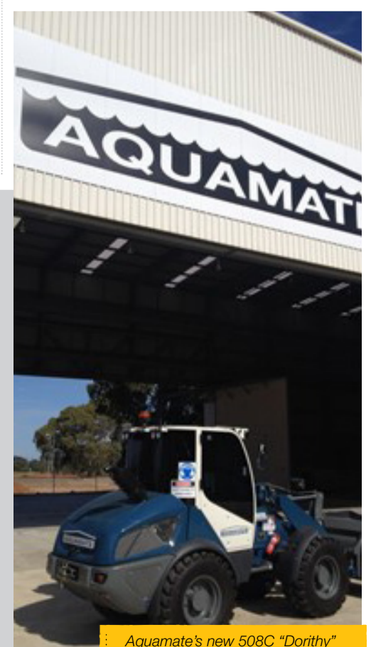
Aquamate's new 508C "Dorothy"

Adding to Aquamate's decision to purchase a Liebherr L 508 C "Dorothy" was the utility of the loader; its combined fork and bucket capability, factory supplied additional safety equipment, low operating weight and increased manoeuvrability made it the most attractive offer that we received."