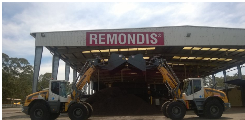
Pictured Above: Liebherr L 542 P High Lift Wheel Loaders on site at the Remondis Organic Resource Recovery Facility at Port Macquarie.

The composting services provided by the ORRF make the region one of the State's highest performing areas for resource recovery. Recently, Liebherr Australia worked with REMONDIS to supply the facility with two new wheel loaders, customised to suite