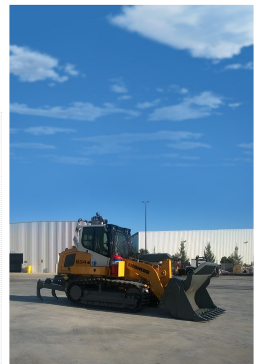
Pictured: Griffith City Council's LR 634 Crawler Loader at the Liebherr Australia Erskine Park, NSW premises for its delivery

Liebherr-Australia has an excellent long term relationship with Griffith City Council, and looks forward to the relationship continuing through the future decades.