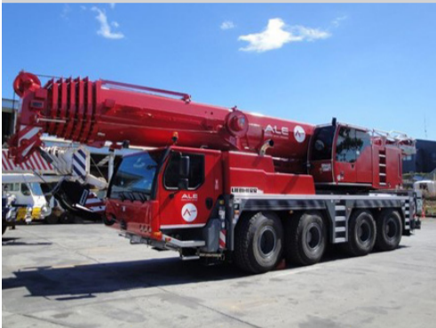
Pictured: The LTM 1100 4.2 purchased by ALE Heavylift.

The recent purchase of an LTM 1100 4.2 All Terrain has increased ALE Heavylift's fleet of mobile cranes to 10. This LTM 1100 4.2 is the first new crane in Australia to be branded with ALE Heavylift company colours and will supplement the existing fleet in the company's Gladstone office.