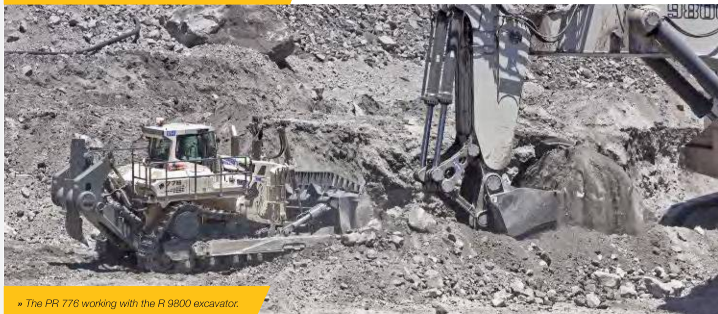
» The PR 776 working with the R 9800 excavator.